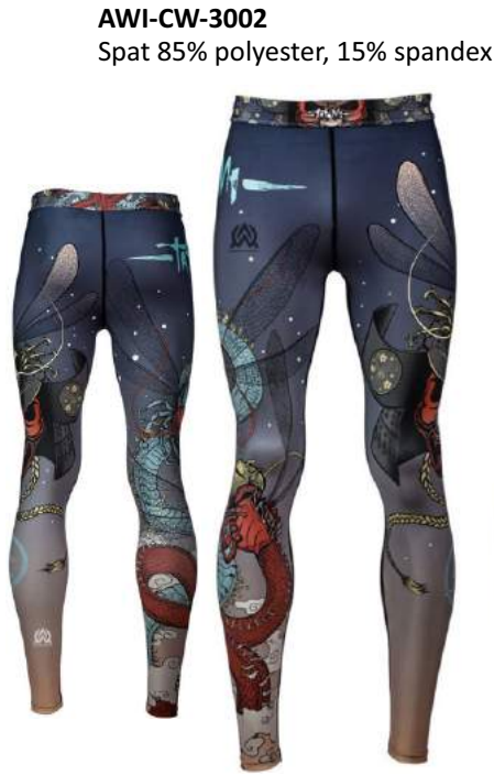
AWI-CW-3002 Spat 85% polyester, 15% spandex