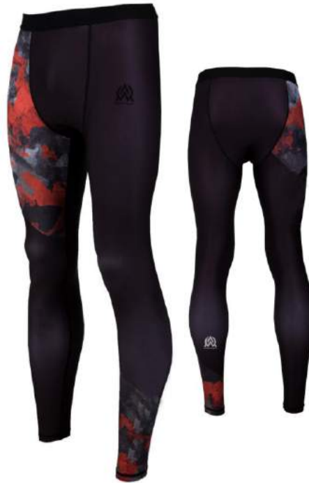
AWI-CW-3005 Spat 85% polyester, 15% spandex