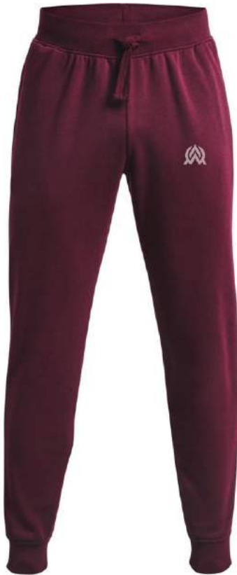
AWI-FW-1401 Standard fit for a relaxed, easy feel Stretch cuffs Pockets 61% cotton/39% polyester Machine wash