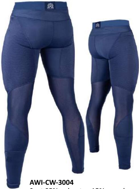
AWI-CW-3004 Spat 85% polyester, 15% spandex