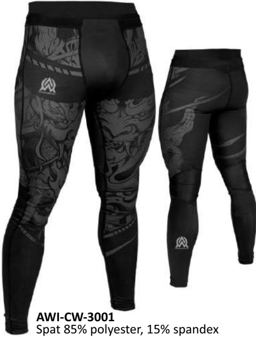
AWI-CW-3001 Spat 85% polyester, 15% spandex