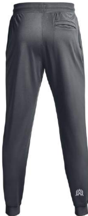
AWI-FW-1403 61% cotton/39% polyester Machine wash