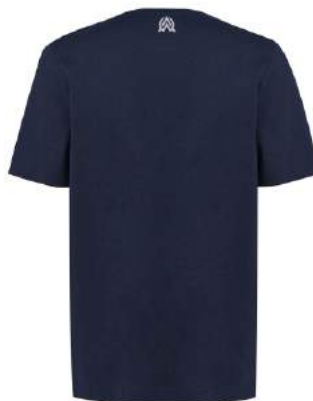
NI-FW-1505-M 60% Cotton, 40% Polyester Performance fabric with the hand of cotton Flattering V-neck silhouette