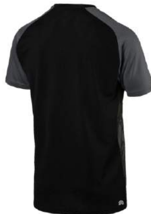
AWI-FW-1506-M 60% Cotton, 40% Polyester Performance fabric with the hand of cotton Flattering V-neck silhouette