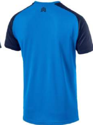
NI-FW-1501-M 60% Cotton, 40% Polyester Performance fabric with the hand of cotton Flattering V-neck silhouette