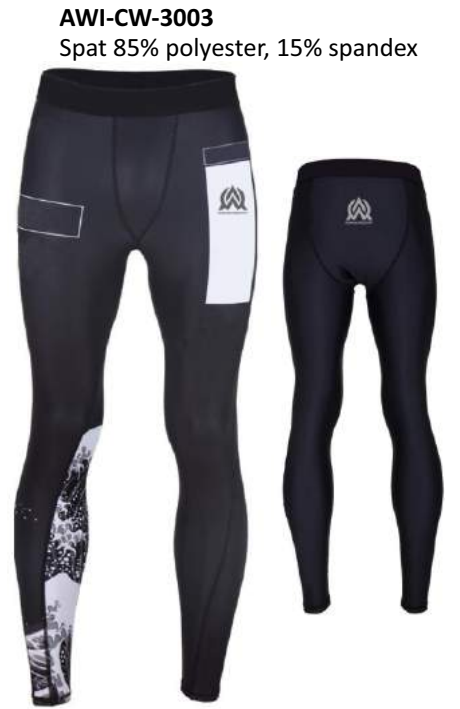
AWI-CW-3003 Spat 85% polyester, 15% spandex