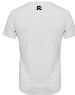
AWI-FW-1504-M 60% Cotton, 40% Polyester Performance fabric with the hand of cotton Flattering V-neck silhouette