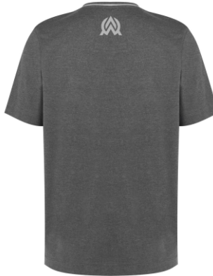
AWI-FW-1502-M 60% Cotton, 40% Polyester Performance fabric with the hand of cotton Flattering V-neck silhouette