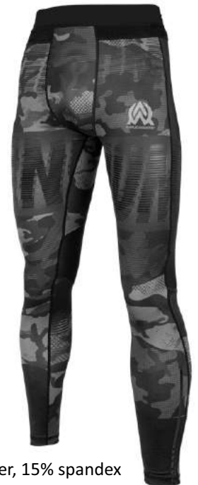
AWI-CW-3006 Spat 85% polyester, 15% spandex