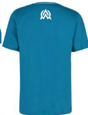
NI-FW-1503-M 60% Cotton, 40% Polyester Performance fabric with the hand of cotton Flattering V-neck silhouette