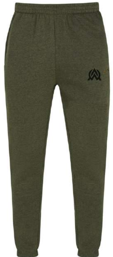
AWI-FW-1404 61% cotton/39% polyester Machine wash